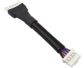
Figure 1 EKRS21 Cable

To enable a successful connection between the BRC073 and the fan coil unit, the connection cable ( BRCW901A0* ) and the EKRS21 cable are needed. Both need to be ordered separately . The EKRS21 converts the connector to a smaller size in order to fit into the S21 port situated within the fan coil.