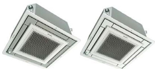
FXZQ-A (silver and Matt Crystal white panel)

Unique in the market, the fully flat cassette is a remarkable blend of iconic design and engineering excellence, with an elegant matt crystal white or a silver and matt crystal white finish. Fitting flush within the ceiling modules and fully flat with the ceiling itself, the cassette is both stylish and unobtrusive.