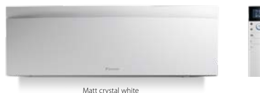
Matt crystal white

Struggling with Hayfever or dust allergies? Harnessing active ionisation to break down organic particles like pollen, dust, fungi, bacteria and viruses, Emura can help you beat the allergy season.