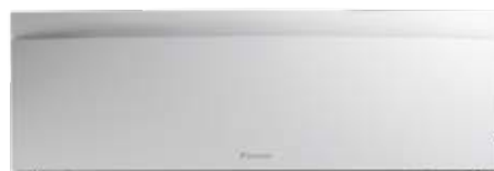
Matt crystal white

Struggling with Hayfever or dust allergies? Harnessing active ionisation to break down organic particles like pollen, dust, fungi, bacteria and viruses, Emura can help you beat the allergy season.